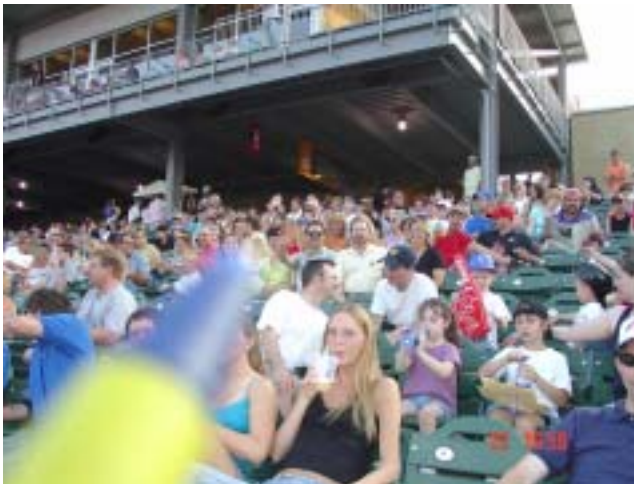
Part of the Great KCIAAO Crowd in Attendance!!