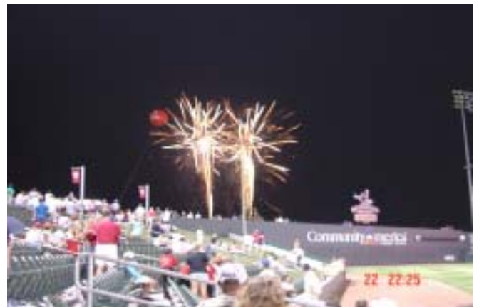
And Finally, Some Great Post Game Fireworks!!