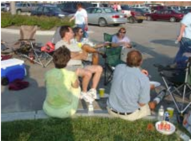
Enjoying a Fine Evening of Food and Conversation